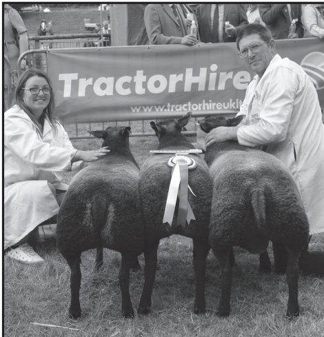
Interbreed Sheep Group of Three Champion A & S Froggatt

Young handlers are welcome to join the Grand Parade, with Non-MV sheep only