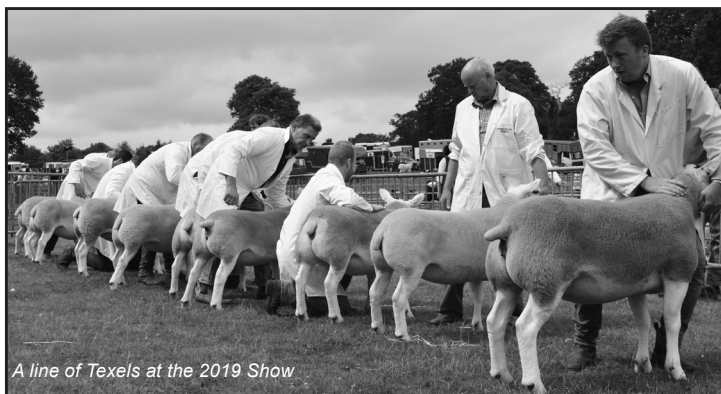
A line of Texels at the 2019 Show