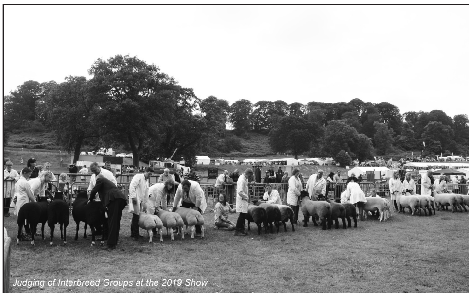
Judging of Interbreed Groups at the 2019 Show

Young handlers are welcome to join the Grand Parade, with non-MV sheep (The 2023 Grand Parade will be for MV sheep only)